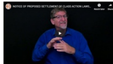
Interpreter captured from a clip of the Harvard Notice of Class Action for people who are deaf or hard of hearing

The University must now pay close attention to its online content, making accessibility of their website and other media platforms, top priority. For the official Notice of Proposed Settlement of Class Action Lawsuit, visit https://harvardcaptioningsettlement.com/ . If you are deaf or hard of hearing and have tried to access or would like to access Harvard's online video content with captions or to access Harvard's online audio content with a transcript, you may be a member of the proposed Settlement Class affected by this lawsuit.