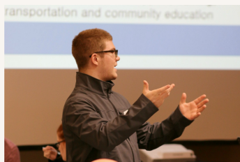
Student stands to give an account of his mentoring experience at the DMD celebration banquet